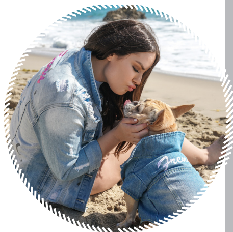
THE STYLISH PUP DOG DENIM JACKET $75.00 BEAUSBABES.COM

always peeled for the next big celebrity story. When Ella's new Devil Wears Prada -type boss starts a not-so-friendly competition among the reporters to find an exclusive story or be fired, the stakes are higher than ever. But is being in Hollywood's elite inner circle worth jeopardizing her friendship with budding actress Holiday Hall and her relationships with her boyfriend and her family? As the competition grows fiercer, her life becomes intertwined in a public scandal that may cost her everything.