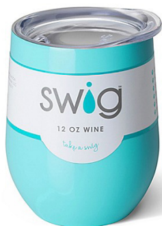
SWIG™ STEMLESS WINE CUP $19.95 SWIGLIFE.COM

Take a Swig in style with this super popular 12oz Insulated Stemless Wine Cup. Swig Vacuum Insulated technology will keep your white wine the perfect kind of cold while you sit out at the pool on a hot summer day, or your coffee hot if you need just one little steamy cup of joe to start your day off right. These beauties can hold up to 12oz - that's two standard glasses of wine.